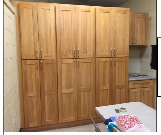
NEW cabinets in kitchen. Thank you to the Hosha Gang for installation and the BWA for financing this project

The Hosha Gang also installed a NEW door between the kitchen and hall. Mahalo plenty!!