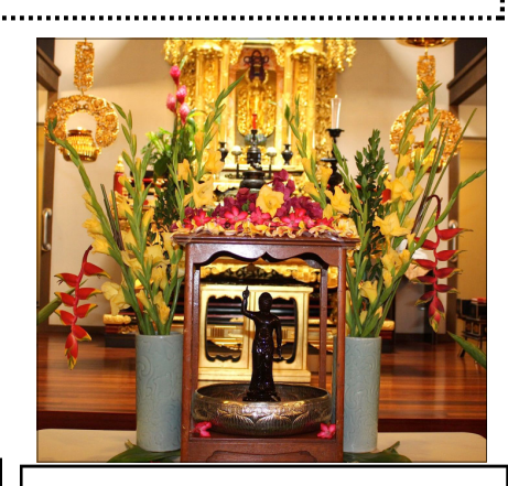
Aiea Hongwanji on April 12