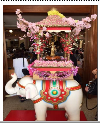
Hawaii Buddhist Council at Soto Mission on April 5 (hanamido)