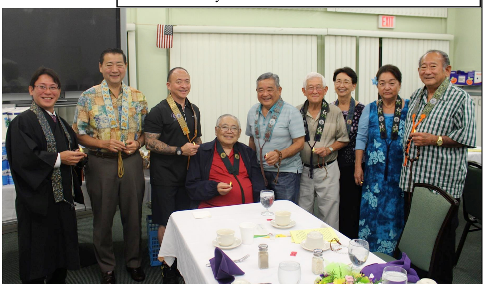
Newly installed officers of the Aiea Senior YBA.