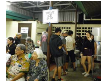
clean up after the bon dance