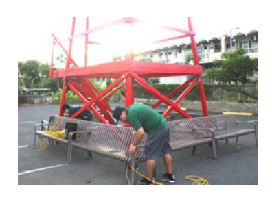
Wednesday —-We stripping down the yagura—roof, panels and weighed it down with the metal benches so it doesn't fly away in the wind.