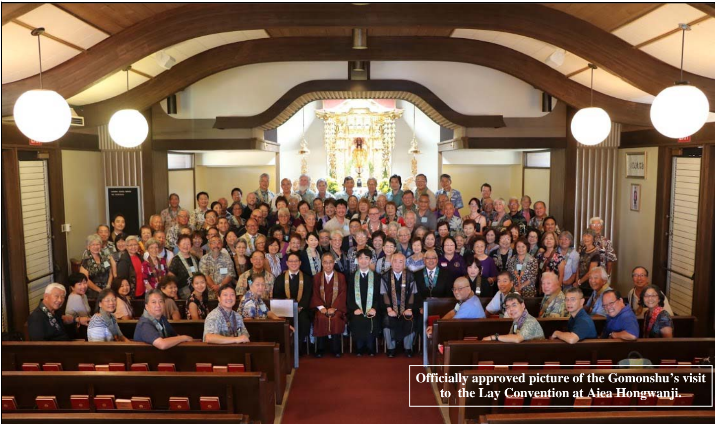
Officially approved picture of the Gomonshu's visit to the Lay Convention at Aiea Hongwanji.