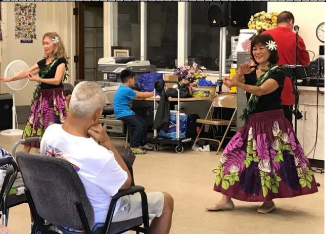
Hula Performance by the Team of Angels.