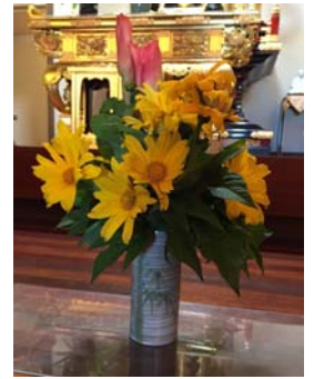
Gotan-e Service Flowers