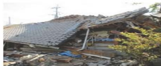
Kumamoto temple hall collapse

Temple members in Hawaii can help by contributing to a special relief fund established by Honpa Hongwanji Mission of Hawaii.