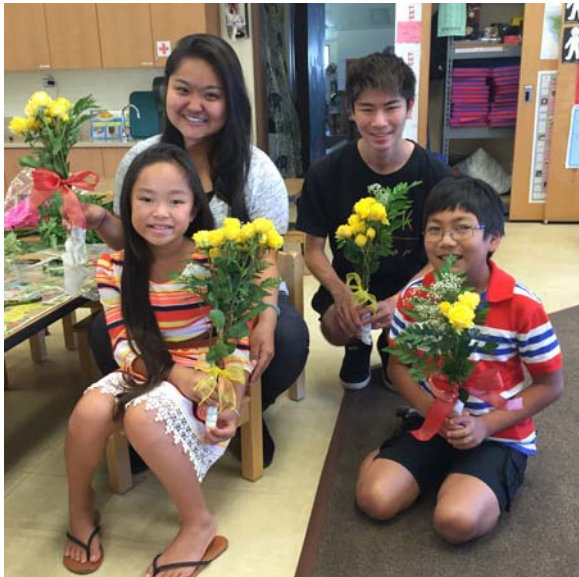
MOTHER'S DAY flowers — Dharma School class.