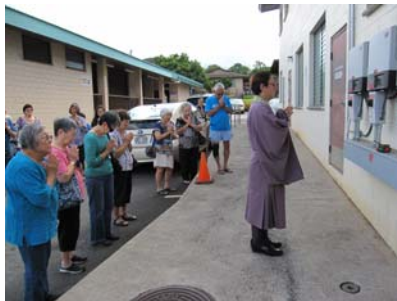
Sutra chanting at the service for the new Photovoltaic system which is finally in operation. These boxes are the inverters.