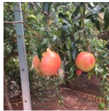
Pomegranates from our garden