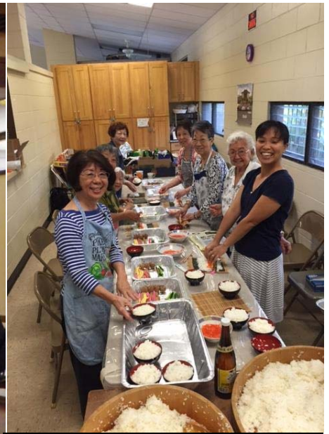
Sushi making in the morning