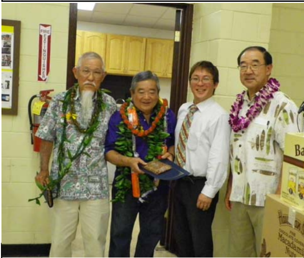
Shinnen- Enkai New Year's Party