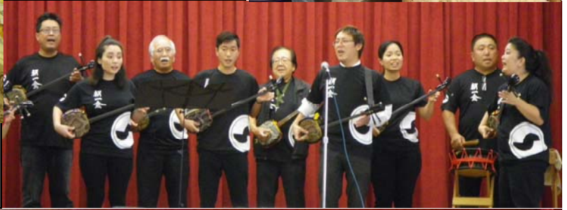
Afuso Ryu Choichi Kai Aiea Dojo