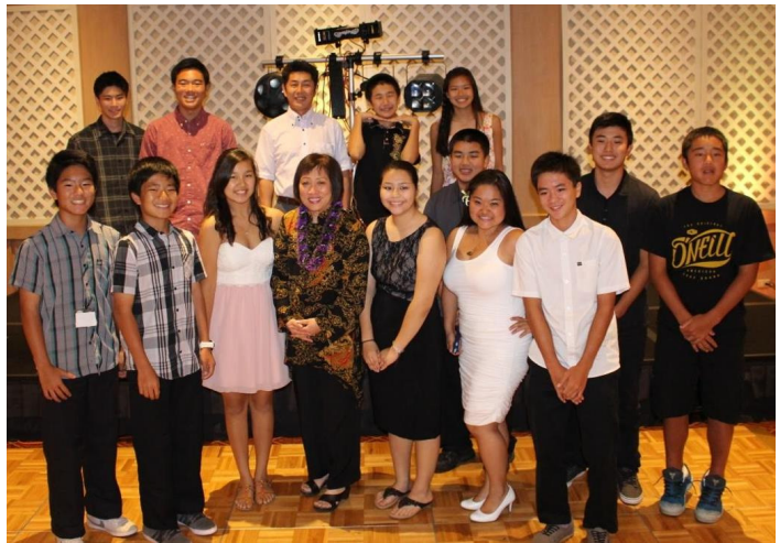
United of O'ahu Juniors with Keynote Speaker Former Representative Colleen Hanabusa