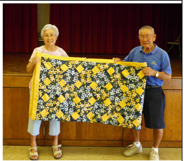
BWA Craft Sale: Beautiful coverlet creator and satisfied buyer. More creations at Bon Dance on August 29.